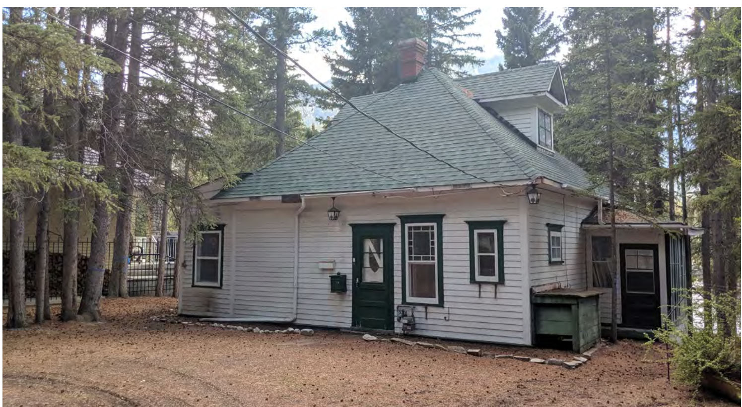
SHUGARMAN ARCHITECTURE+DESIGN INC